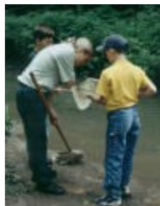
Help sponsor Outdoor education programs.

By becoming a member, you show your support for Argyle Lake State Park. Your newsletter will introduce you to the park staff and inform you of projects, plans, and activities going on in the park.